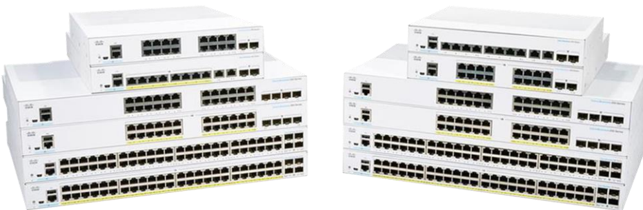
Figure 2. Cisco Business 350 series managed switches

The Cisco Business 350 Series Switches, part of the Cisco Business line of network solutions, is a portfolio of affordable managed switches that provides a critical building block for any small office network. Intuitive dashboard simplifies network setup, and advanced features accelerate digital transformation, while pervasive security protects business critical transactions. The Cisco Business 350 Series Switches provide the ideal combination of affordability and capabilities for small office and helps you create a more efficient, better-connected workforce. When your business needs advanced networking features and security for the digital transformation yet value is still a top consideration, you're ready for the Cisco Business 350 Series Switches.